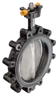
Butterfly valve D6..WL with lug type and visual position indicator ZPR01

Wafer types: PN 6, 10, 16 / DN 50 – 300 Lug types: PN 10, 16 / DN 50 – 150 PN 16 / DN 200 – 300