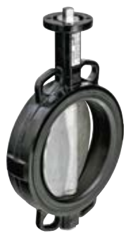
Butterfly valve D6..NW with wafer type